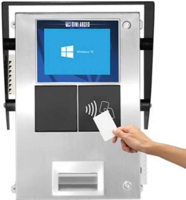
6116BOX: with RFID reader.